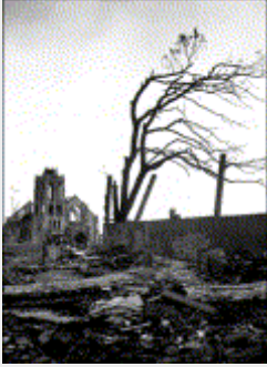
Hiroshima on Aug 6, 1945, after the bomb was dropped